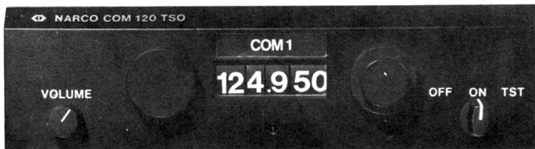
FIGURE 1-1. COM 120 TSO FRONT PANEL

The COM 120 and COM 120/20 operate identically. They are energized by turning the ON/OFF switch CW past the click to the ON position. Continued CW rotation to the TST position will deactivate the Unit's automatic squelch feature. In the ON position, the squelch will "break" at the RF level that produces a 6 dB S+N/N.